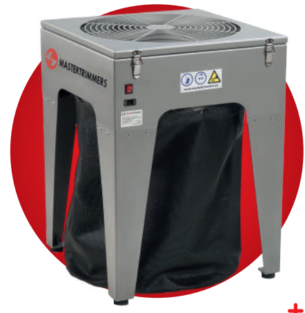
MT STANDARD 75