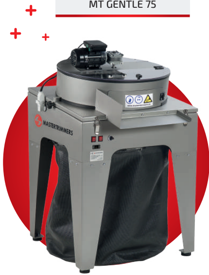
MT GENTLE 75