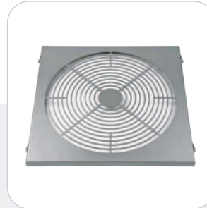
Stainless steel grid (without paints)